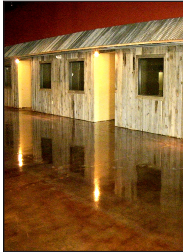
Ideally suited as a tough clearcoat over smooth decorative concrete