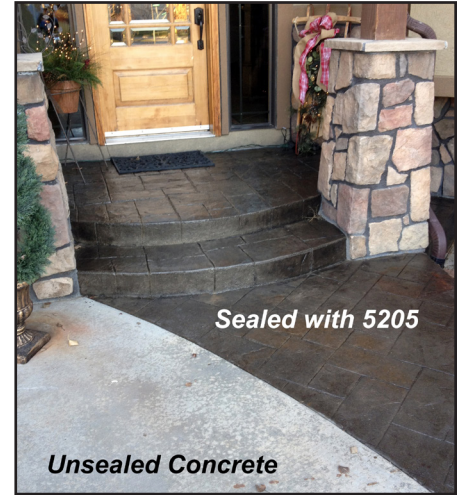
5205 applied to a stamped concrete entrance